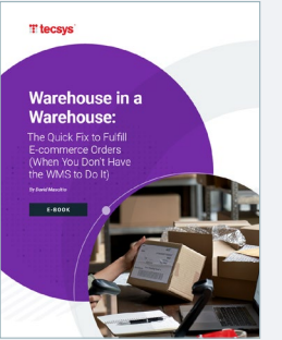
Warehouse in a Warehouse: Fulfill E-commerce Orders (When You Don't Have the WMS